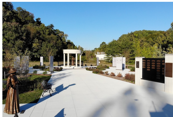
Turning Point Suffragist Memorial, Fairfax, VA, 2020