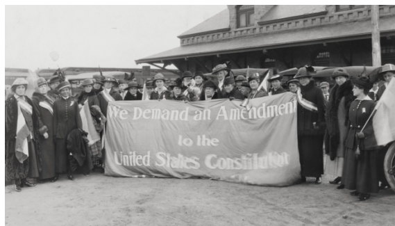
Suffrage Special envoy, Colorado Springs, CO, April 1916