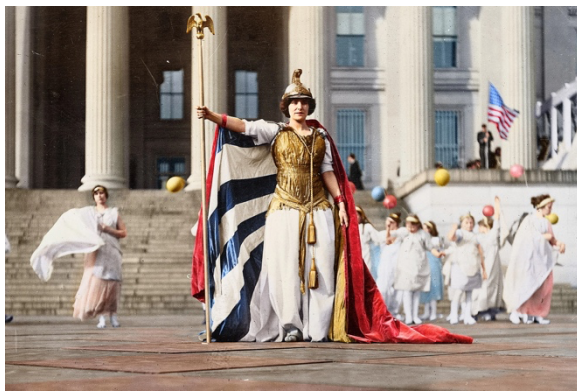
Parade participants, Washington, DC, 1913 (colorized)