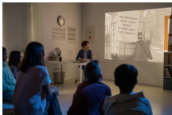
Viewing suffrage documentary (visualization)