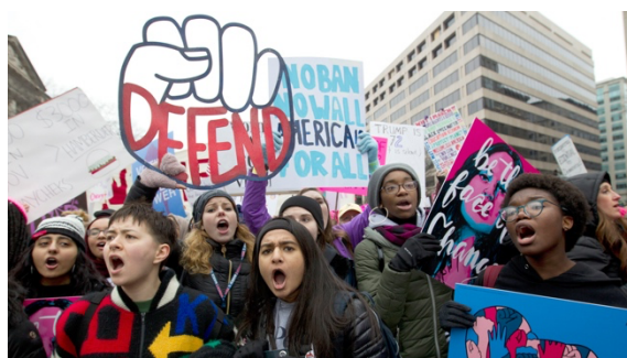
Women's March, Washington, DC, January 2019